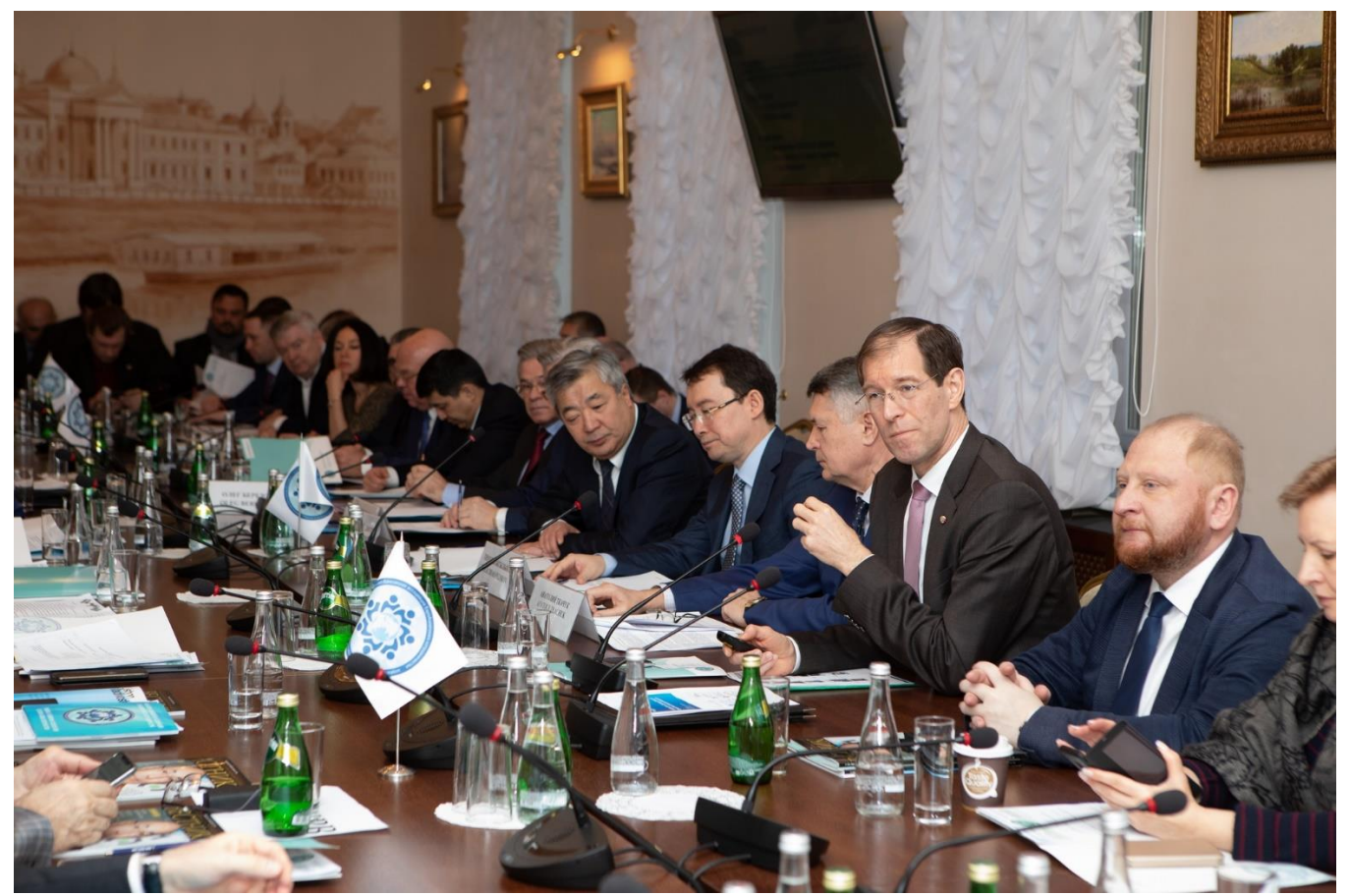
March 6, 2020 Annual General Assembly of the members of Association was held in Heard Office of Financial & Banking Association of Euro-Asian Cooperation (Kotelnicheskaya st. 17, Moscow).

Issues of function of Association in 2019, approval of working directions in 2020, introduction of changing of the statute FBA EAC due to reorganization of the Association, approval of new version of Reference term of FBA EAC, elections in the executive board of Association were the main themes for discussions.